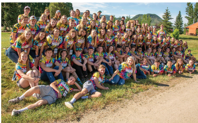
Campers from Colorado, Kansas, Oklahoma and Wyoming attended the Cooperative Youth Leadership Camp near Steamboat Springs, Colorado, from July 12-18.